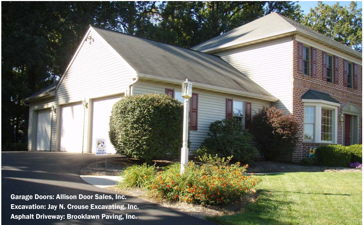
Garage Doors: Allison Door Sales, Inc. Excavation: Jay N. Crouse Excavating, Inc. Asphalt Driveway: Brooklawn Paving, Inc.