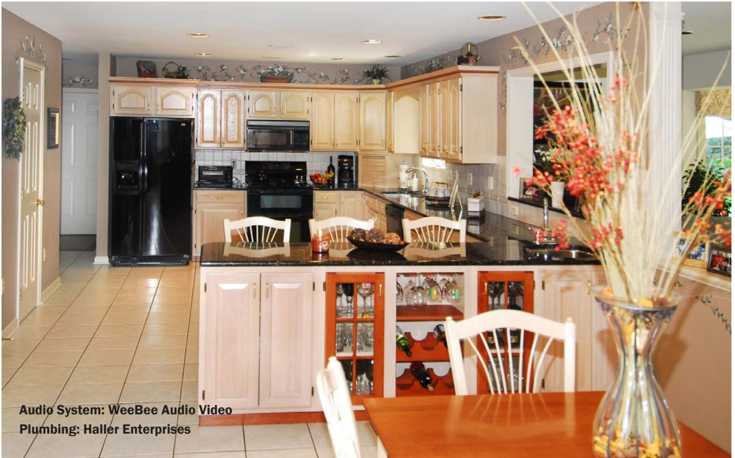
Audio System: WeeBee Audio Video Plumbing: Haller Enterprises