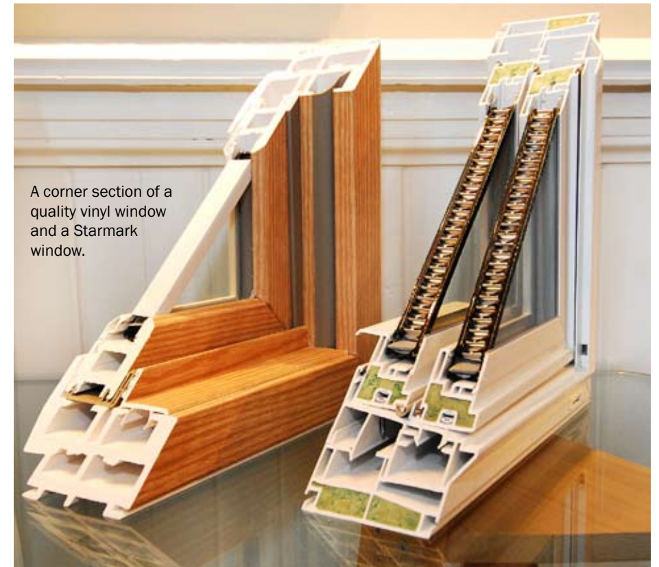
A corner section of a quality vinyl window and a Starmark window.

We are a family-owned company you can trust—our non pro-rata warranty applies not only while you own the home but for subsequent owners as well. Should you experience accidental damage to your Aspen windows? No problem, Aspen products and labor are covered for life.