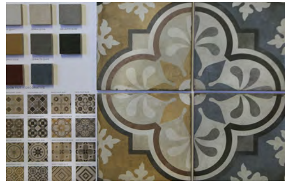
Pattern tiles with colors instead of black/gray with white (left)

info@HeritageDesignInteriors.com HeritageDesignInteriors.com