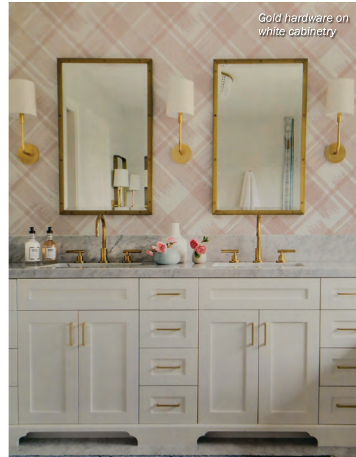
Gold hardware on white cabinetry

White cabinetry has been a favorite for many years. We are starting to see more color on cabinetry with navy blue, deep green, charcoal and black. Natural wood finishes in beams, posts, countertops, and