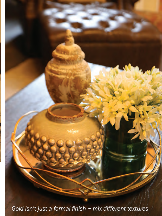
Gold isn't just a formal finish ~ mix different textures

As I always say, trends come and go! There are so many styles,