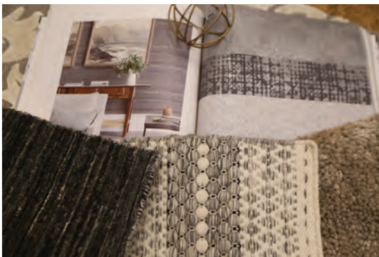
Area rugs with different textures (above)