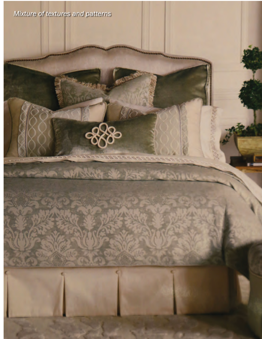
Mixture of textures and patterns

flooring are very handsome with these deep colors. Mixing in brick and stone adds texture to the space when used on an accent wall, in flooring, and on fireplace surrounds. Wainscoting isn't for below chair rail only. There are so many styles of wainscoting that can be used. You can use it on an accent wall or all the walls of a room. Don't wainscot or ship lap every wall of your home.