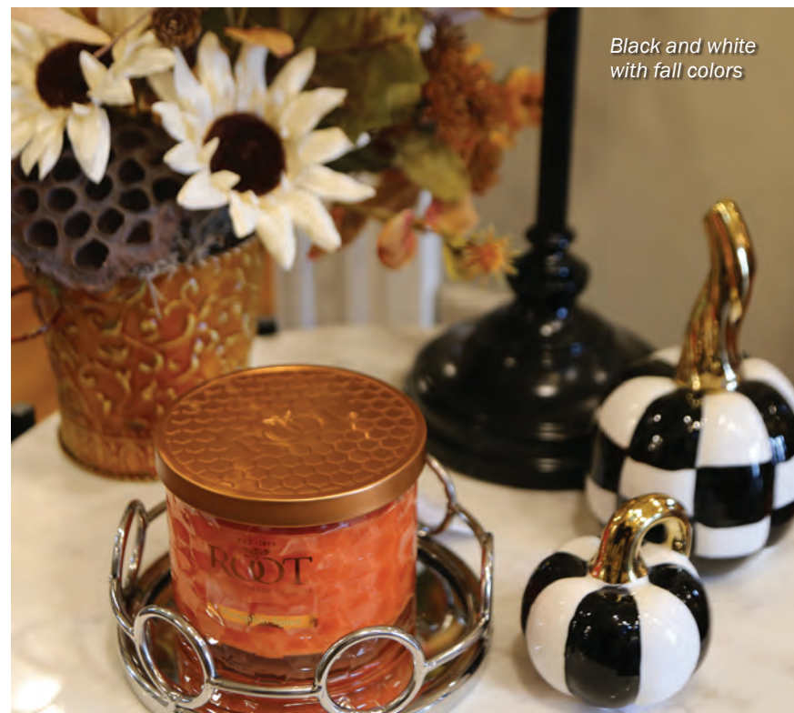
Black and white with fall colors