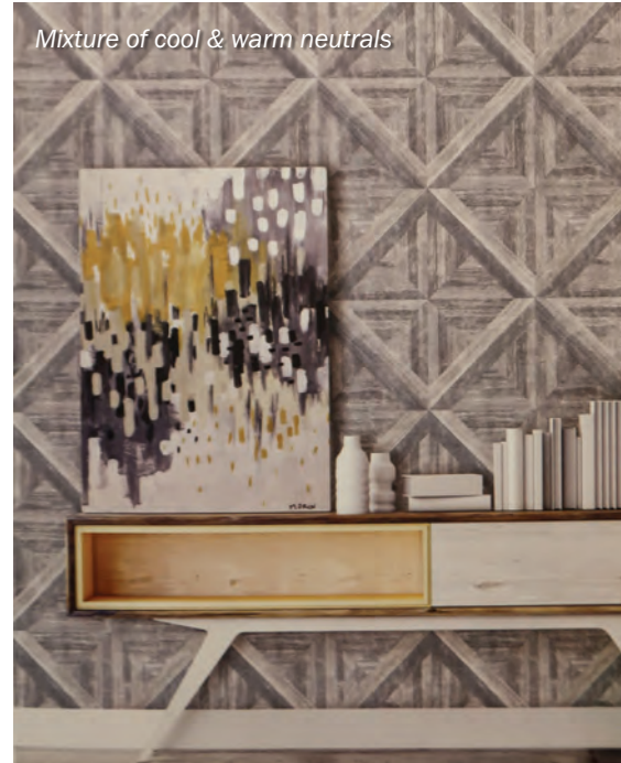
Mixture of cool & warm neutrals