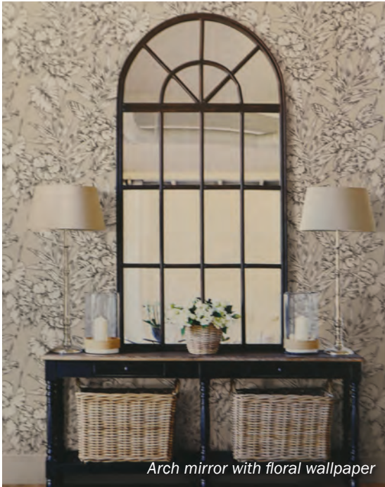
Arch mirror with floral wallpaper