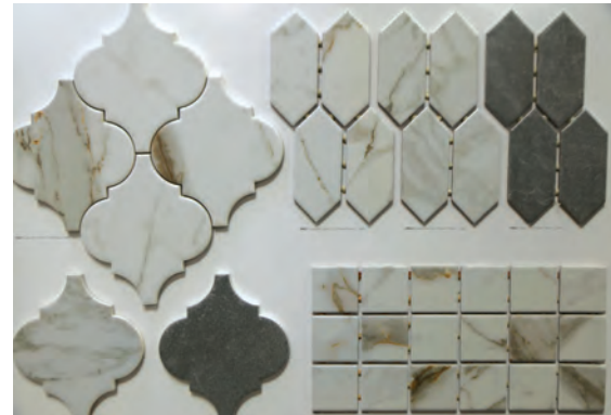
Hardwood floor stains are warming up (center) compared to the light & dark grays of recent years (above)