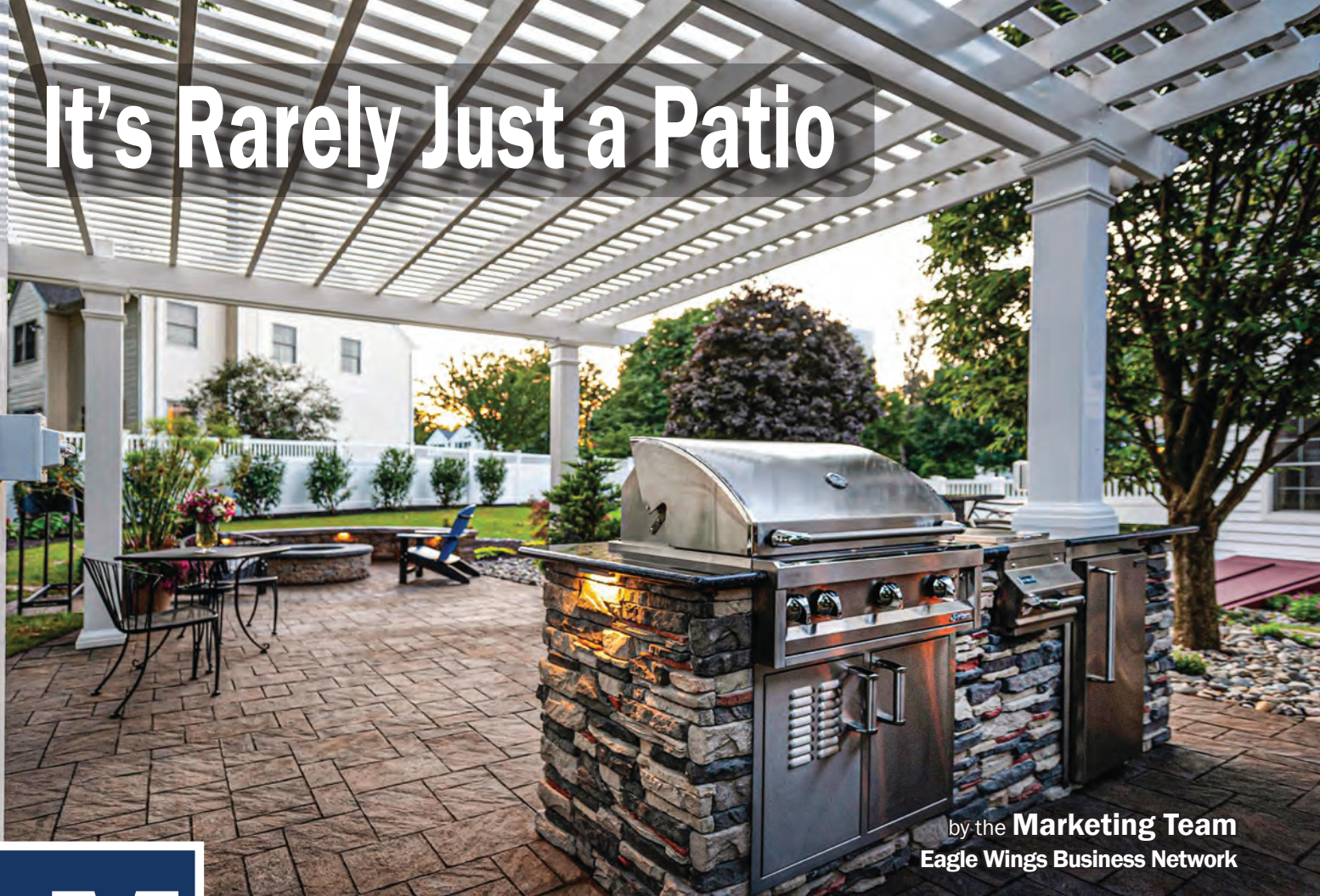
by the Marketing Team Eagle Wings Business Network